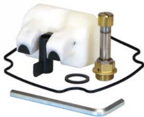
Service kit available