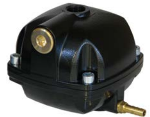
Designed with top and side inlet options